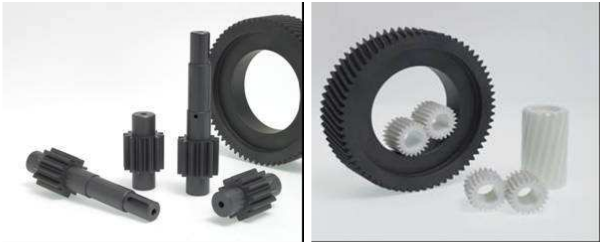
Fig.2: Examples of precision ground gear-wheels made of different ceramic materials