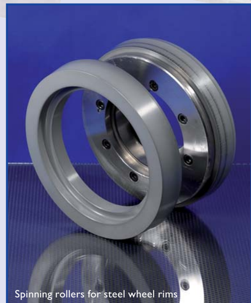
Spinning rollers for steel wheel rims