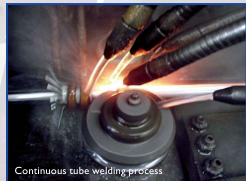
Continuous tube welding process